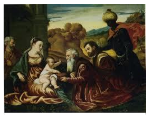
The Adoration of the Magi Polidoro da Lanciano

But peaceful was the night When such music sweet Their hearts and ears did greet, As never was by mortal finger strook, Divinely warbled voice Answering the stringed noise, As all their souls in blissful rapture took: The air such pleasure loth to lose, With thousand echoes still prolongs each heavinly close.