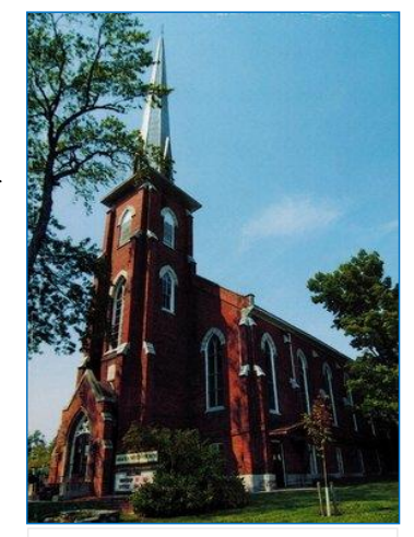
Grace United Church, Napanee

century, the consensus of the visitors that day was that its effectiveness is limited. Partly this was the effect of the normal tonal designs of the late 1930's, with little upperwork and often